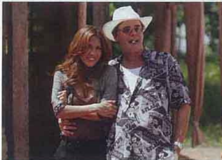
A biscotti on the side...