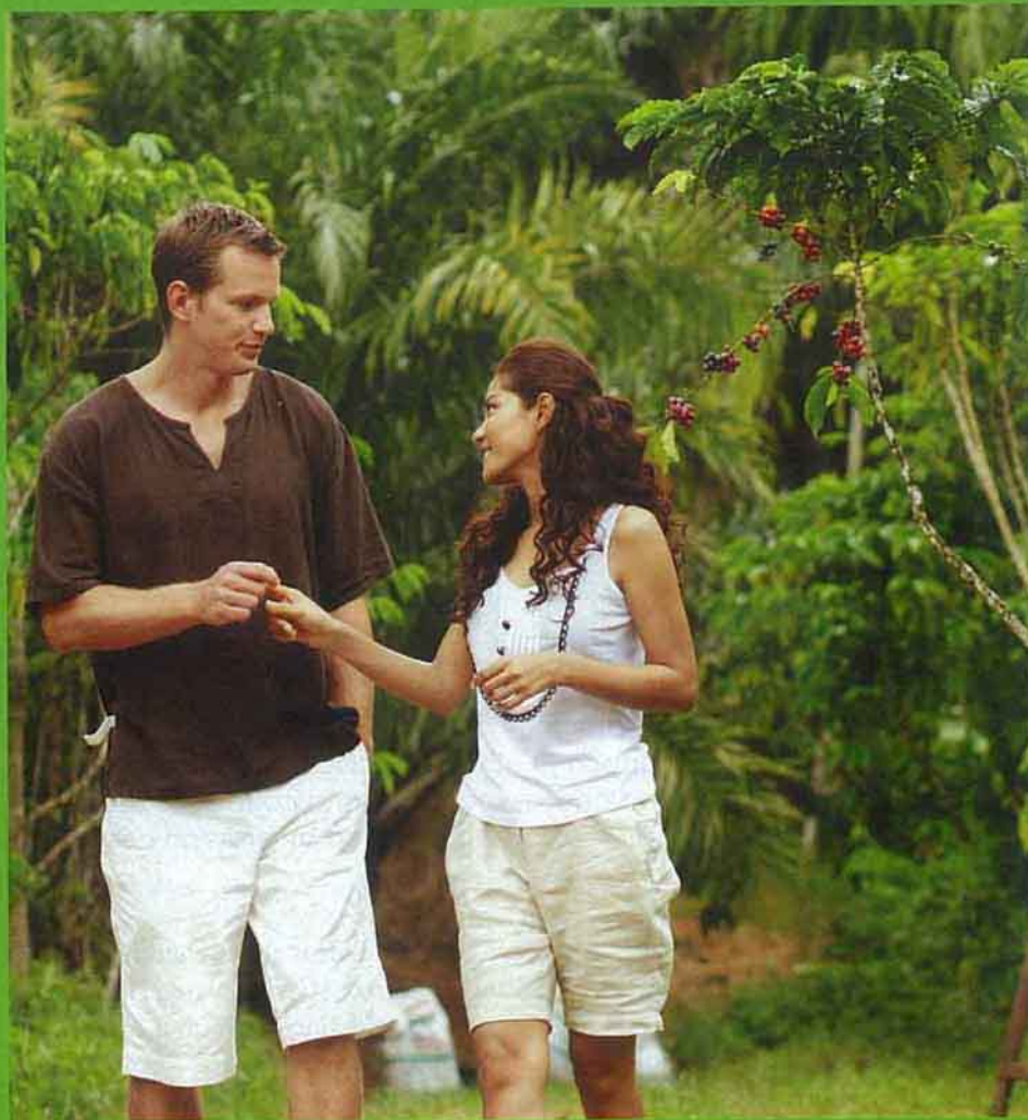
Actors Kip Pardue and Mamee Nakprasit in a scene from the Thai-US feature film “Bitter/Sweet”, shot on locations in the coffee fields of Southern Krabi, Thailand in June 2008