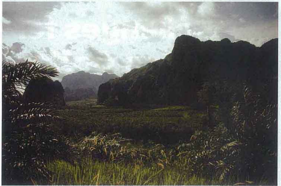
Filmed on location on coffee plantations in beautiful Southern Krabi