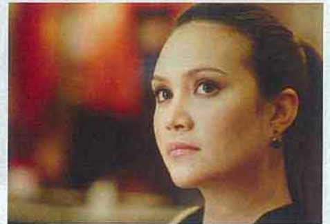
The iconic Tata Young